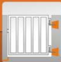
○ Doors and gates