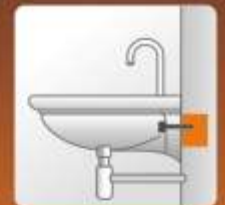
○ Sanitary facilities