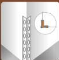
○ Corner irons