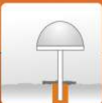
○ Outdoor lights